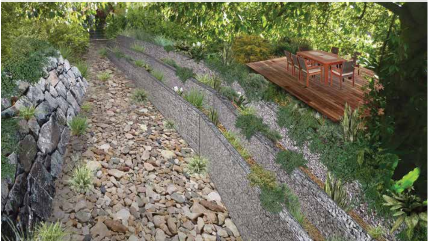
After – using gabions (rock filled wire baskets)