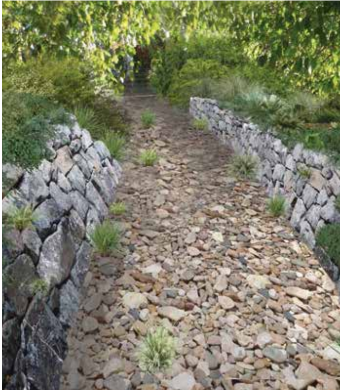
After – using dry stone walling