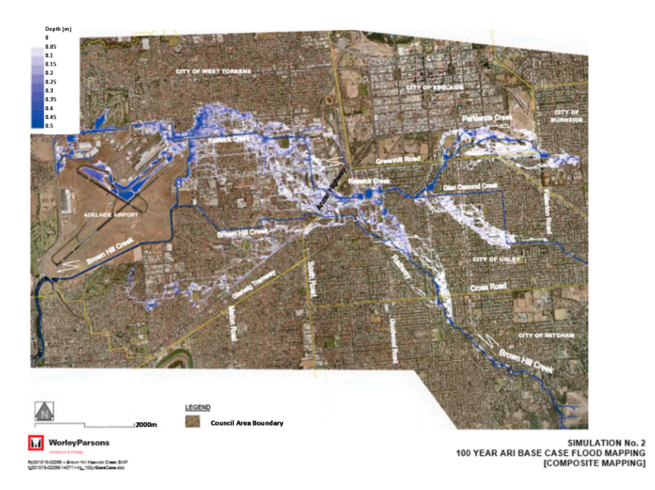
Figure 1. Composite flood map for 100-year average return interval floods of 1.5, 6 and 36 h duration events in the absence of a stormwater management plan (from BHKC, 2016 [2]). Flood depths for shown overflows from Brownhill and Keswick Creeks range from the shallowest 0 to 5cm (shown as white) through to the deepest at 45 to 50cm (shown as the darkest blue). Parts of unshaded areas may also be flooded to shallow depths by lack of capacity in local drainage systems that discharge to these creeks.

stormwater management plan was needed, and that all councils would need to take responsibility to prevent excessive flooding in the downstream council areas, shown for a composite map of 100-year average return interval floods (Figure 1). Brownhill Creek flows from the south east through the Cities of Mitcham and Unley to the City of West Torrens in the west before discharging into the Gulf of St Vincent to the west of Figure 1. Keswick Creek flows from City of Unley in the east and is joined by a northern tributary passing through the Cities of Burnside and Adelaide before connecting with Brownhill Creek just east of the airport in the City of West Torrens.