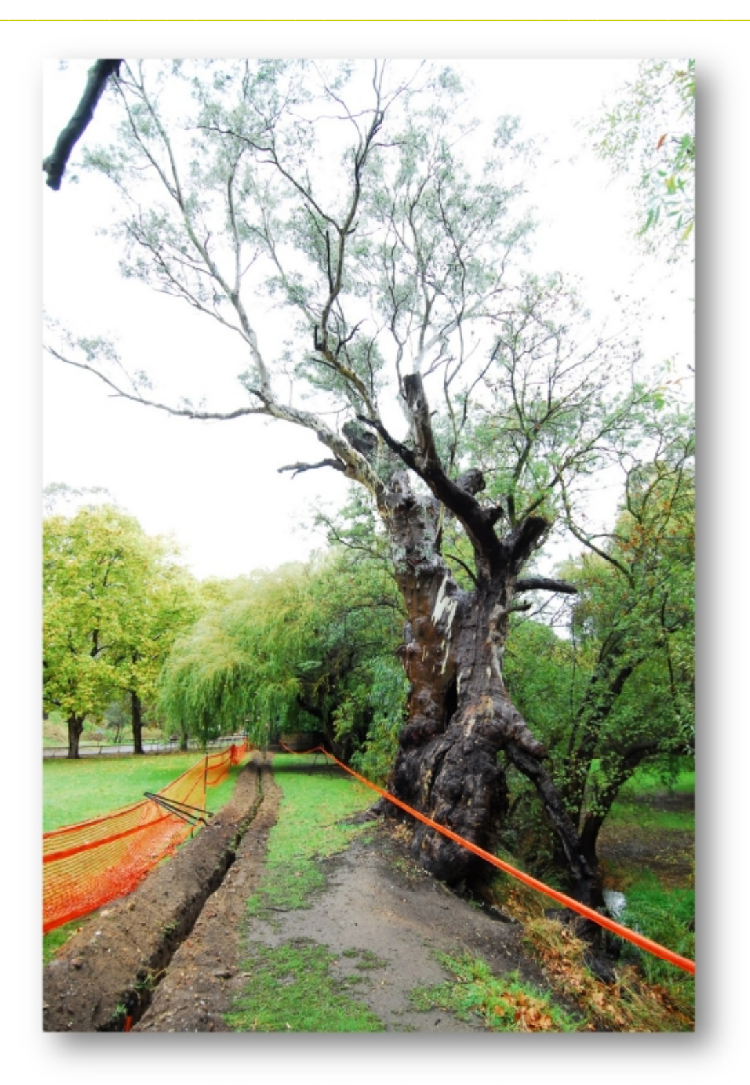
Recent trenching near the Kaurna shelter tree. Fortunately no major root damage has been inflicted by this process. It is unlikely there will be any ongoing health consequences associated with the trenching.