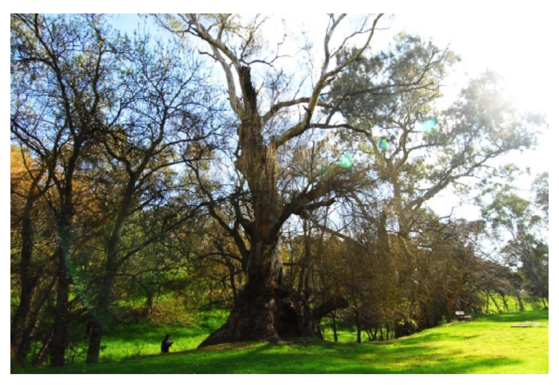
Image above: The ~250mm diameter branch overhanging the turf area to the north is the largest branch most likely to fail into the target zone. The QTRA assessment conducted on this tree indicates the risk posed by this branch is low. No action can be justified at this time to further mitigate and already low risk. NOTE: significant changes to site occupancy levels may increase the risk of harm posed by the tree.