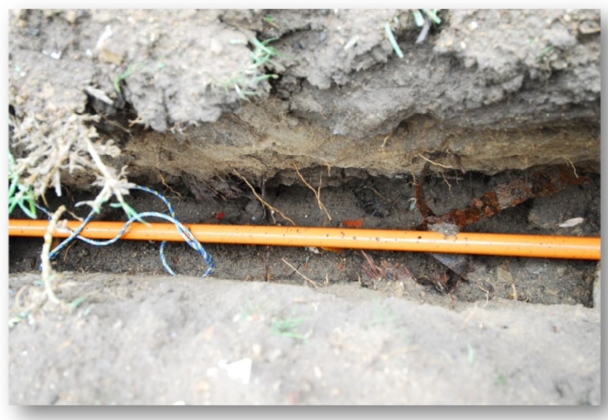
Image above: The trenching revealed layers of imported gravel and soil and well as buried debris within the root zone east of the tree.