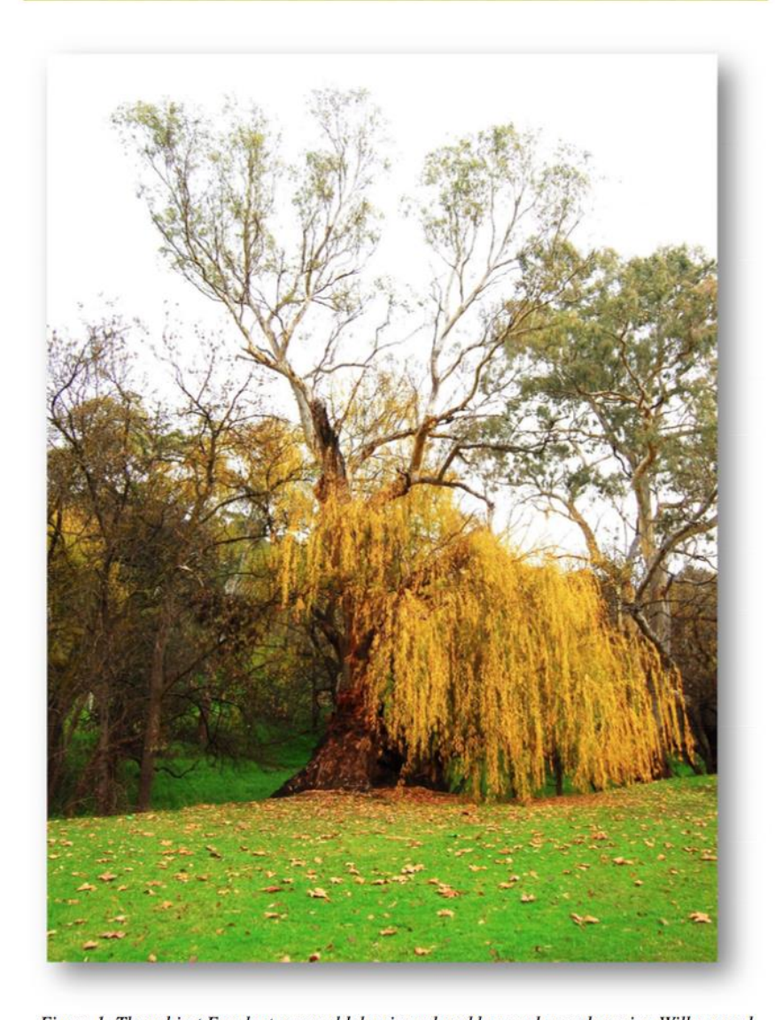
Figure 1: The subject Eucalyptus camaldulensis enclosed by woody weed species, Willows and Desert Ash on the edge of Brownhill Creek.