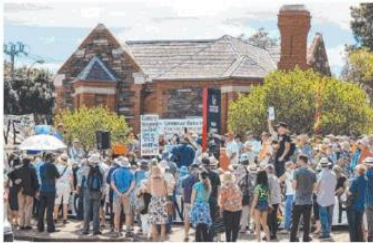
Yesterday's crowd protesting against plans to demolish the Waite Gatehouse Lodge.