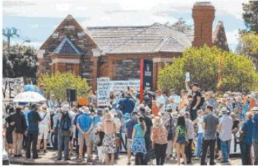
Yesterday's crowd protesting against plans to demolish the Waite Gatehouse Lodge.